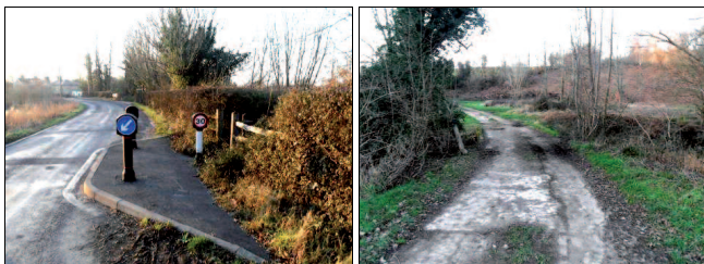
Pic 1: The turning onto the public footpath

Continue straight along the pavement (follow a 'Public Footpath' signpost) and walk up the hill along the school ground until a wooden gate. Go through it and carry on until a T-junction with a road. Turn right onto the road and keep walking until a crossroad with a larger road. Turn left onto this road and after 30 yards (30m) it turn slightly right onto a smaller road. Continue along it and go back to The Vineyard.