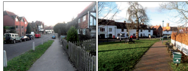
Pic 3: Lamberhurst High Street from the west