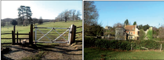
Pic 3: The gate leading into the castle estate