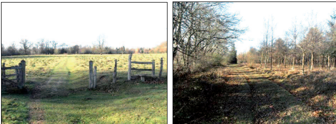
Pic 5: The gate in between the fields surrounding the castle