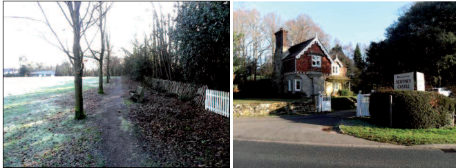
Pic 1: The trail leading from The Vineyard