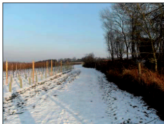
Pic 6: The vineyards surrounding the pub, covered by snow