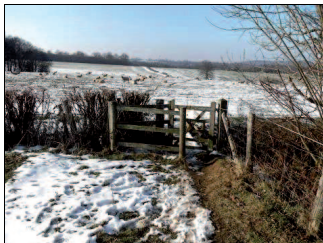
Pic 3: The wooden gate separating the fields