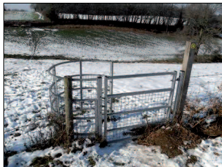
Pic 2: The metal gate in between the fields