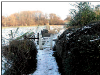
Pic 5: The small white gate in Furnace Mill