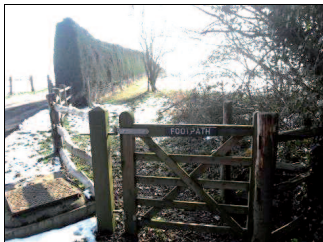
Pic 1: The gate leading to the public footpath