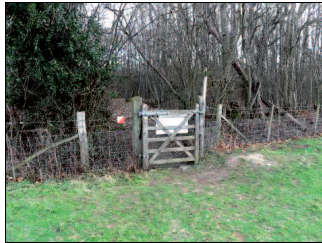
Pic 1: The gate in between the fields surrounding Bewl