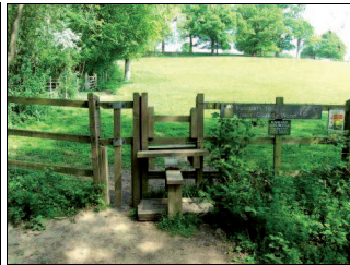
Pic 2: The style leading into the fields around the reservoir