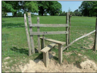
Pic 3: The style in between the fields