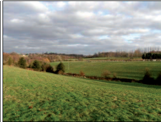
Pic 4: One of many nice countryside views