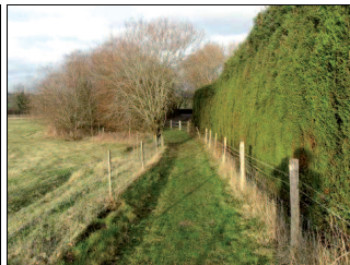
Pic 6: The path in between the fences close to Misty Meadow Farm