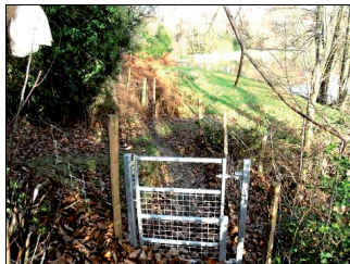
Pic 5: The metal gate along a small trail